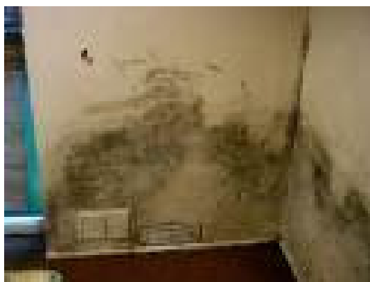
Condensation 'Black Spot' ( Aspergillus Niger )

The filters on a Flatmaster will prevent dust, pollen, insulation fibres and other floating pollutants from entering the home. Flatmaster has over twice the filter area of any competitor. Nuaire have arrived at this filter area following 20 years experience. In addition, only Nuaire use the high efficiency G3 filter material, fine enough to take out pollen. Replacement filters can be purchased through your supplier