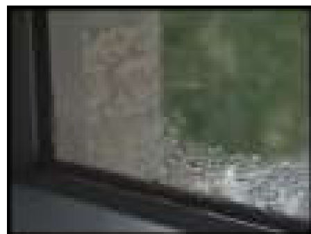
Condensation on windows