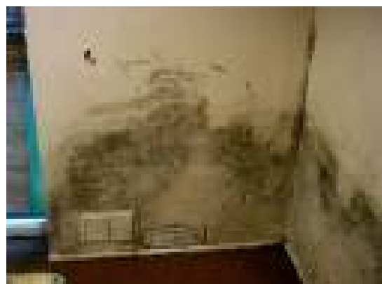
Condensation 'Black Spot' ( Aspergillus Niger )

The filters on a Flatmaster will prevent dust, pollen, insulation fibres and other floating pollutants from entering the home. Flatmaster has over twice the filter area of any competitor. Nuaire have arrived at this filter area following 20 years experience. In addition, only Nuaire use the high efficiency G3 filter material, fine enough to take out pollen. Replacement filters can be purchased through your supplier